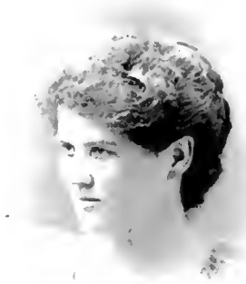
BELLE CASE LA FOLLETTE.

LAMB, Mrs. Martha Joanna, historian, born in Plainfield, Mass., 13th August, 1829. She has long been a resident of New York City, where she has earned her reputation of the leading woman historian of the nineteenth century. She is a middle-aged woman, a good talker and a most industrious worker in the historic and literary field. Recognition of her genius has been prompt and full. She has been elected to honorary membership in twenty-seven historical and learned societies in this country and Europe, and she is a life-member of the American Historical Association and a fellow of the Clarendon Historical Association of Edinburgh, Scotland. She holds her precedence by the high character and importance of the subjects to which her abilities have been devoted. She is at present the editor of the "Magazine of American History," a position of great responsibility which she has filled acceptably for ten consecutive years. The name that this periodical has won, of being the best distinctively historical magazine in the world, and its growth since Mrs. Lamb has occupied the editorial chair, tell very forcibly that she not only